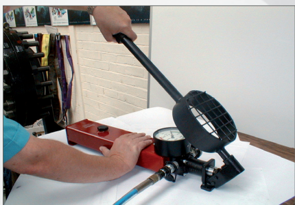
Portable Hand Operated Pump Unit.