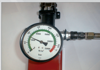
High Pressure gauge