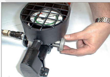
Manual pressure release valve